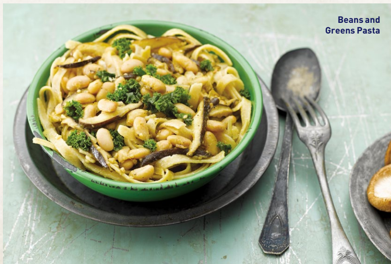
Beans and Greens Pasta