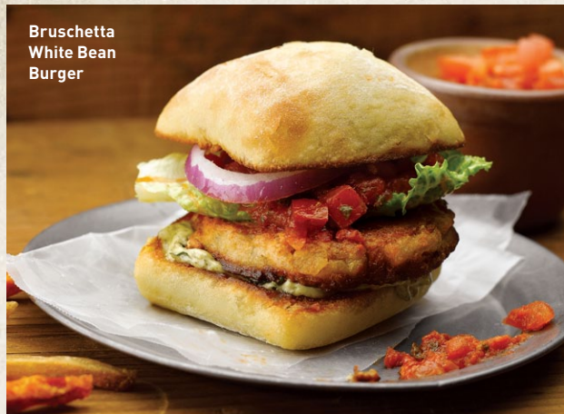
Bruschetta White Bean Burger