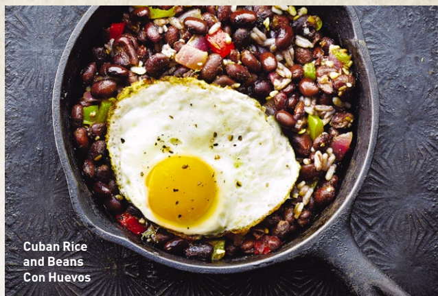
Cuban Rice and Beans Con Huevos