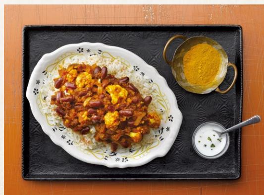
Red Bean and Cauliflower Curry Over Basmati Rice