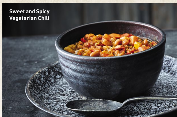
Sweet and Spicy Vegetarian Chili